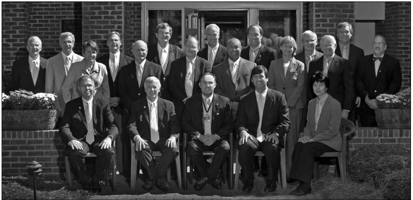
ABOS Board of Directors September, 2008

The original mission statement of the ABOS has evolved over the years to embrace recertification and now maintenance of certification. We can be certain that as part of our obligation to serve the public and the profession that there will be future changes in the process of Board certification in orthopaedic surgery. The ABOS is rightfully proud of their role in restoring the health of Americans and the education of many of the world’s finest orthopaedic surgeons. With 75 years of excellence we all can be proud of what it means to be a Board Certified Orthopaedic Surgeon.